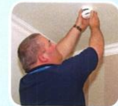
Smoke detector fitting