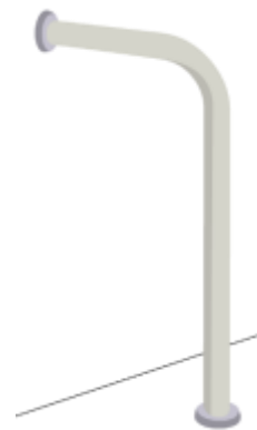
Wall to floor rail